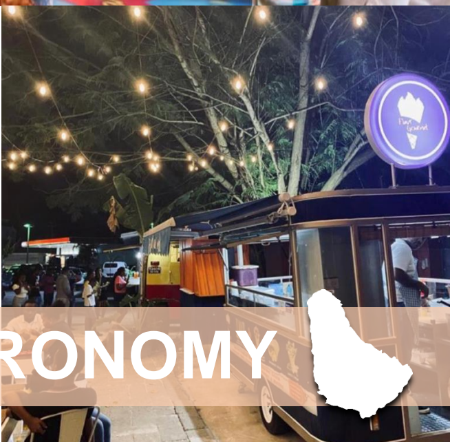
Worthing Square Food Garden